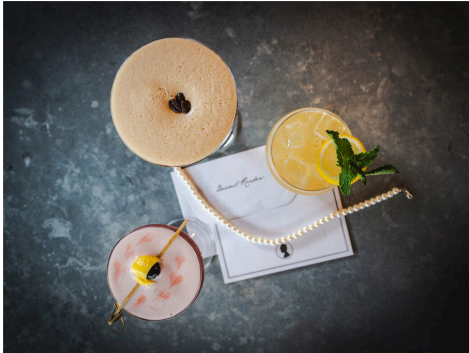
Red Owl Tavern — Photo by K. Reporto